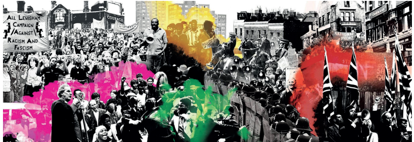
Battle of Lewisham mural

During the 40th anniversary events in August 2017, people of all ages and abilities created forty vibrant collages telling the complex story of the Battle of Lewisham to inform a future public artwork.