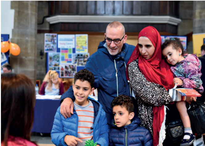
Phoenix Community Housing residents

Phoenix Community Housing has provided £600k of funding from their annual Community Chest to support five community projects in Downham and Bellingham.