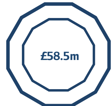
Outside of London