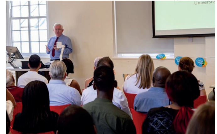
Meet the Buyer event, June 2018

Through the Lewisham Construction Hub, eight Lewisham businesses have secured contracts worth over £2,787,929.